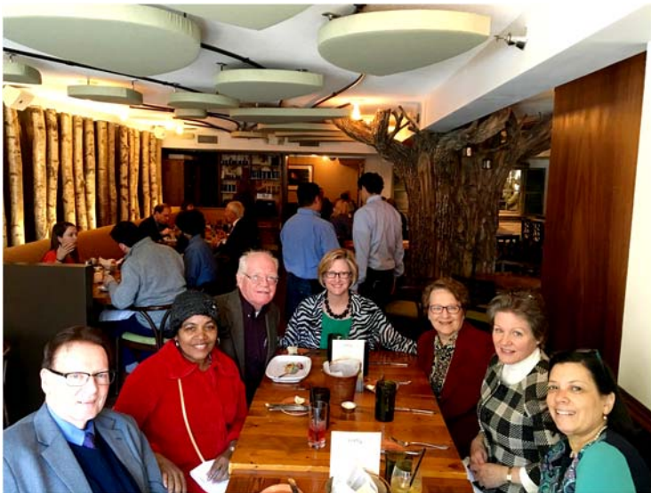
Friends and partners in ministry.

Our new neighborhood in Brookland. Come see us!