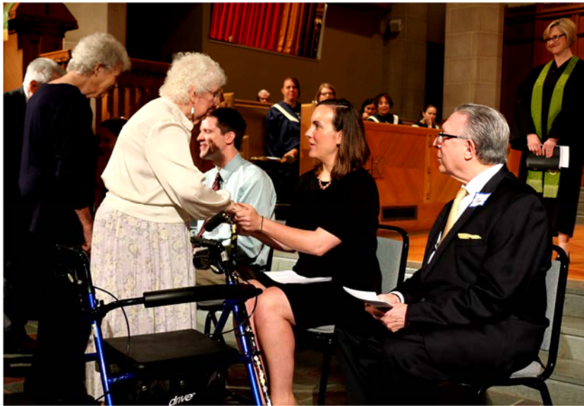
Deacon Ordination and Installation